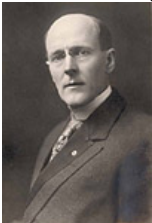
WHO IS THIS GENTLEMAN? Paul Harris is the Founder of Rotary and his name is given to the Fellowships.

If you need help with the process let me know (Editor)