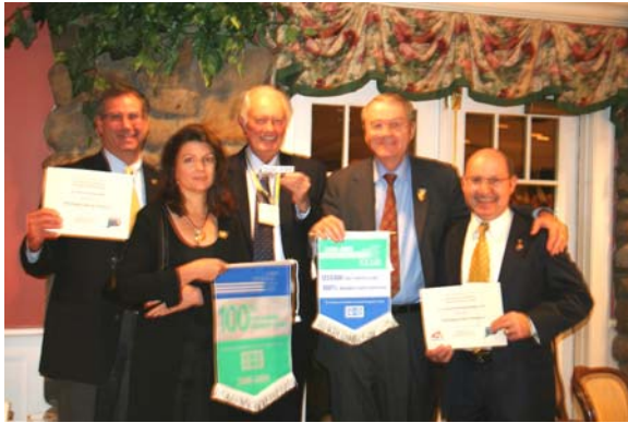
The Dinner team proudly displays the 'winnings'! The White Knights Club; 100% Sustaining members of the Every Rotarian Every Year Scheme; and 100% contributions under the EREY scheme.