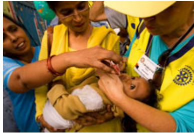
Polio Plus the Final Push.

BULLETIN #67 NOVEMBER 22, 2009 - FOUNDATION SPECIAL: