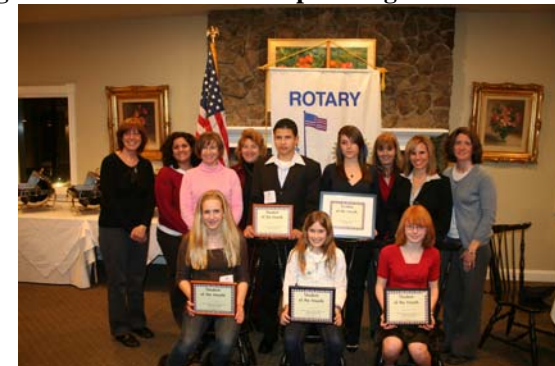
March Students of the Month with their Teachers.