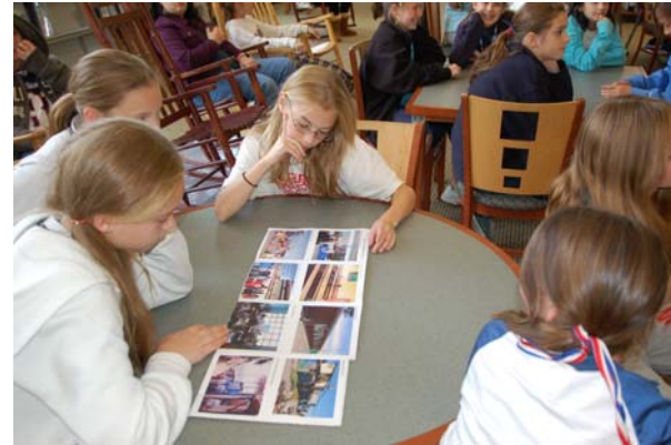
Reed School Students study the pictures of the school in Costa Rica.