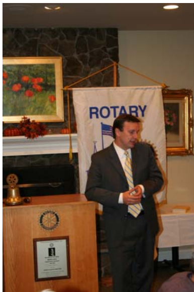
CONGRESSMAN CHRISTOPHER MURPHY Connecticut 5 th District,